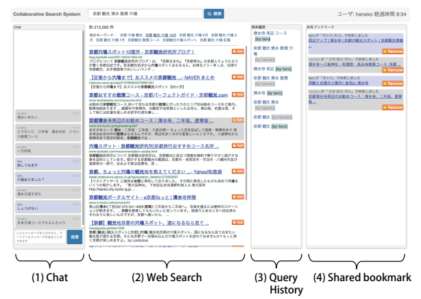
Figure 1: Collaborative search interface used in user study.

study, we focus on a typical situation of CIS in which a pair of users collaborate [4, 8, 12, 14]. We also focus on a remote setting where each member is located in distant places [14].